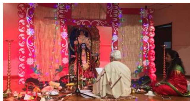
Kali Puja, 2017