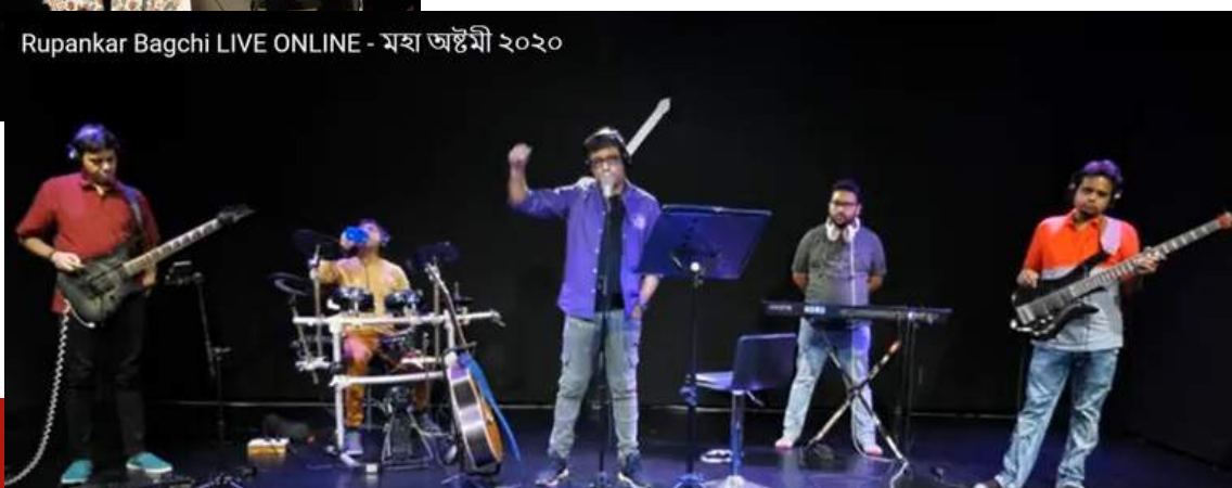
Cultural evening @Durga Puja 2020